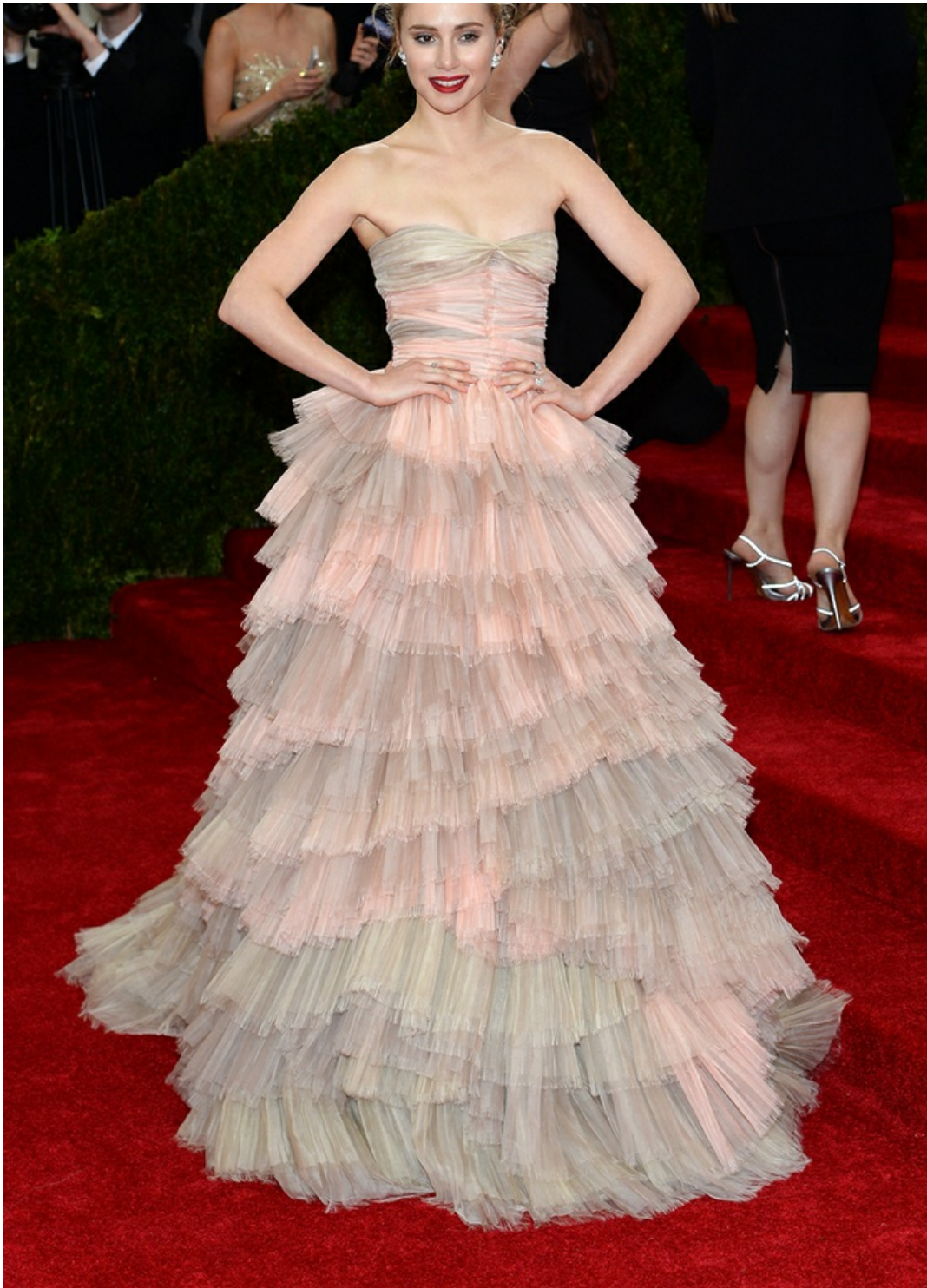
Suki Waterhouse at the "Charles James: Beyond Fashion" Costume Institute Gala at the Metropolitan Museum of Art.