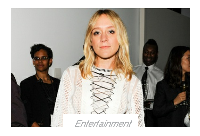
Chloë Sevigny Launches a New Zine, and More of Today's News